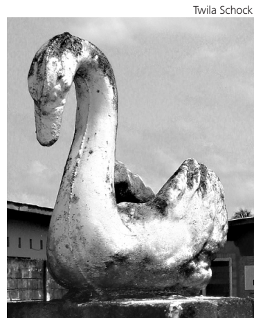
Paulus church gate, Lelydorp, Suriname