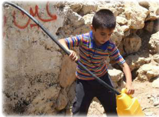
B'Tselem Photo by: Atef Abu A-Rob

Top Right: Water crisis in Jenin District