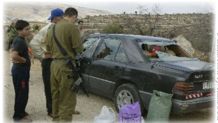
Palestinian vehicle damaged by settler attack

• “Considering Israel's obligations under international law, the Israeli authorities must adopt all the necessary measures to prevent to the greatest extent possible attacks by Israeli settlers against Palestinian civilians and their property, in response to the removal of settlement outposts,” a UN report stressed, adding that in 2009, on average 13 Palestinians per month were injured in settler-related violence. 28